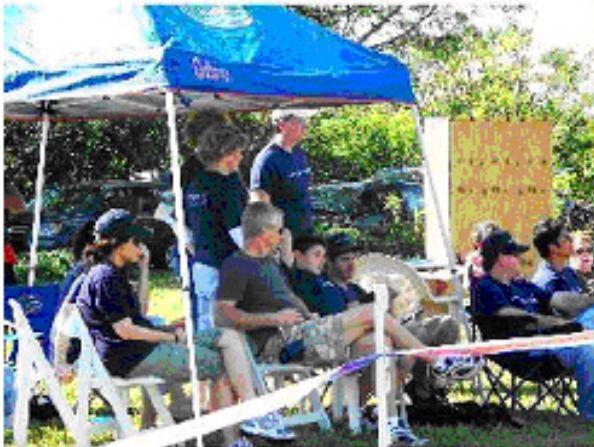
The Crowd Enjoying the Show