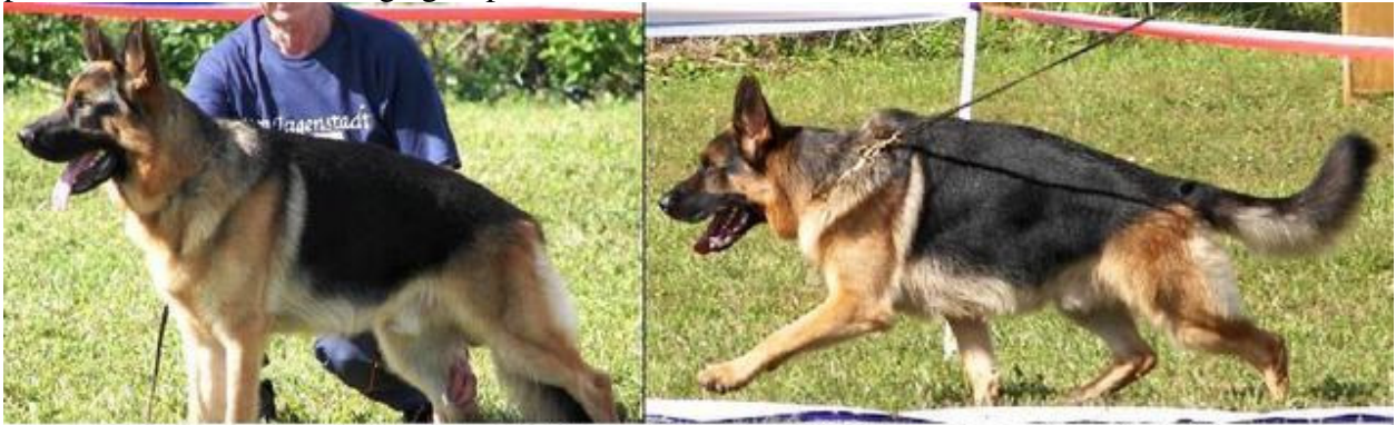
SG-1 Leri Xerox "Tito" (Chijas Weiko - Leri Ulrikke)