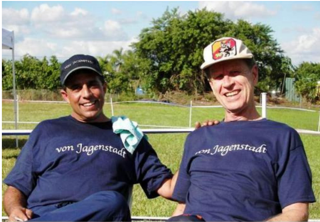
The Good, The Bad and The Ugly...Guess which is which?