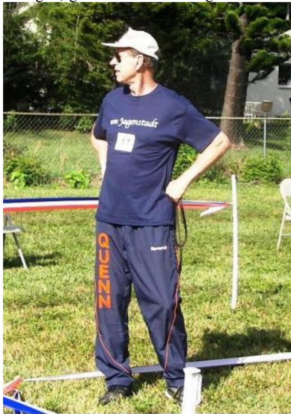
Waiting for my next class dog

I had nothing in the next class, and a single-entry Rosi Haus Brezel (by Hassan Schwalmbergtal) gave me a chance to get a drink of water in the shade and look for my next dog.