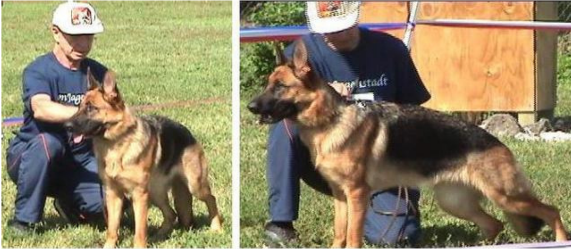
SG-1 Fayr van Corsalabroek "Kiri" a Winner Assault daughter