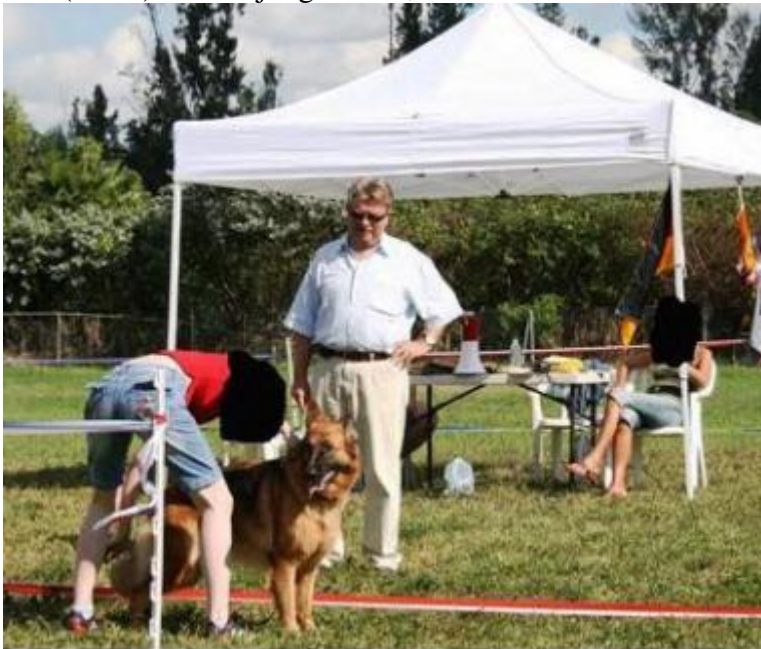
G-1 Zambi von Haus Barkus

In Adult untitled classes, club member Brittany Banus' single-entry coated bitch got a G-1 (Good) but the judge noted, "no structural faults". She was indeed very well put together.