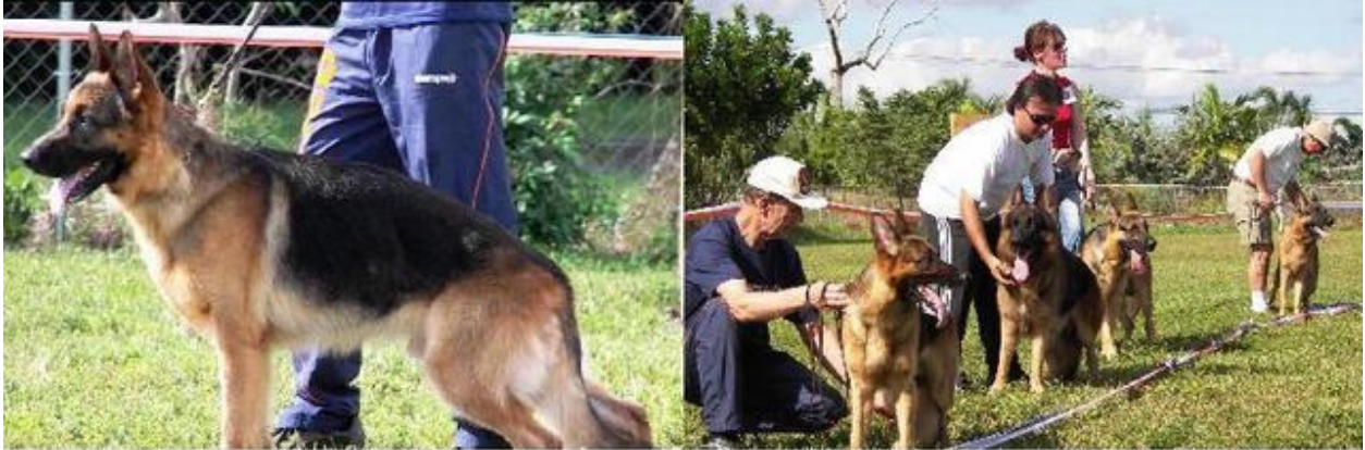
SG-1 Leri Gallon (Leri Unesco - Leri Odessa) "Also completed BH & AD"